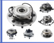
Wheel Hub Bearing