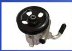
Power Steering Pump