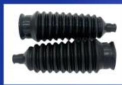
Steering Gear Boots