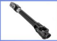
Steering Column Shaft