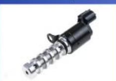
Oil Control Valve