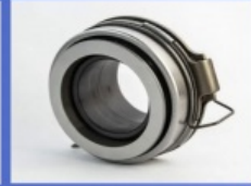
Clutch Release Bearing