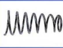
Shock Absorber Spring