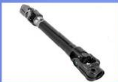
Steering Column Shaft