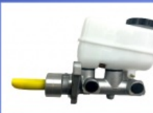
Brake Master Cylinder