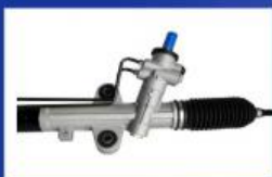
Power Steering Rack