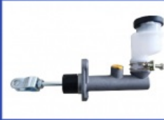
Clutch Master Cylinder