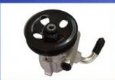
Power Steering Pump