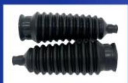
Steering Gear Boots