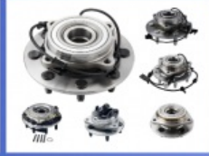
Wheel Hub Bearing