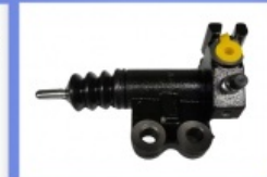
Brake Slave Cylinder