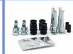
Brake Repair Kit