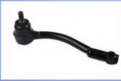
Tie Rod End