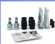
Brake Repair Kit