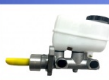
Brake Master Cylinder