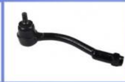
Tie Rod End