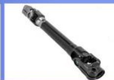
Steering Column Shaft