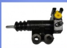
Brake Slave Cylinder