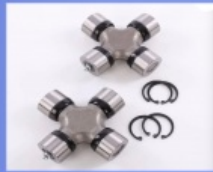
Universal Joint Bearing