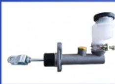
Clutch Master Cylinder