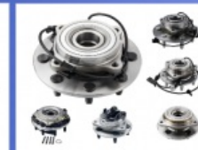
Wheel Hub Bearing