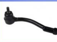
Tie Rod End