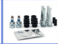
Brake Repair Kit