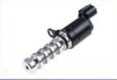
Oil Control Valve