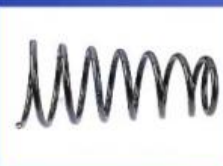
Shock Absorber Spring