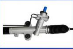
Power Steering Rack