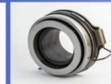
Clutch Release Bearing