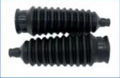
Steering Gear Boots