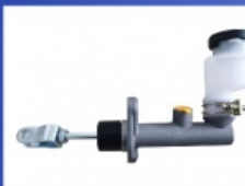
Clutch Master Cylinder