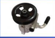
Power Steering Pump